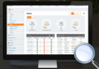
Network management AirWave with northbound XML APIs for data consumption