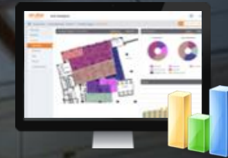
Location analytics Analytics and Location Engine (ALE) with northbound REST APIs