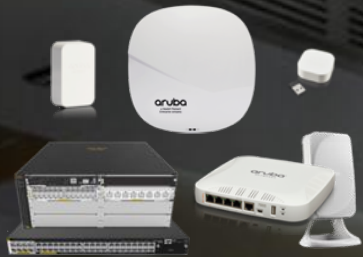
Aruba infrastructure: Wi-Fi, BLE, Wired, WAN