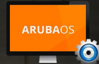
Network controls AOS8 with REST APIs to share context and program infrastructure