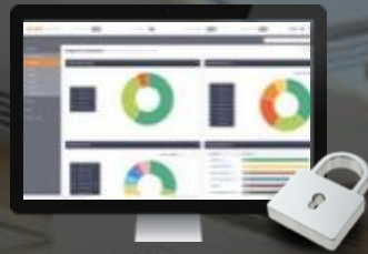
Policy management ClearPass with a unified API library and Extensions repository