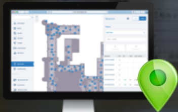
Micro-location services Meridian with mobile app development SDK and REST APIs