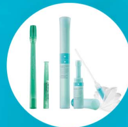
SpeediCath ® Compact