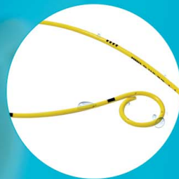
Imajin ® Hydro